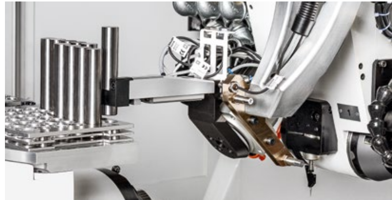
Option Top loader

Productivity Package (24 kW spindle and glass scales); Top loader; HSK spindle; measuring probe for measuring the grinding wheels; manual support steady rest; manual tailstock; workpiece holder with torque motor; sharpening stone holder; work table; vapour separator; silencer; fire extinguishing system; Automatic, electric measurement of machine reference (AEMDM); etc.