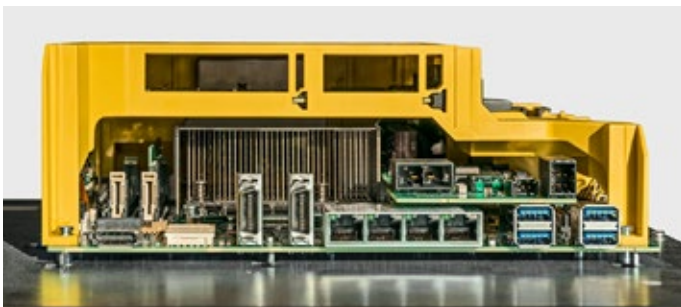
MMI computer mounted on the back of the screen